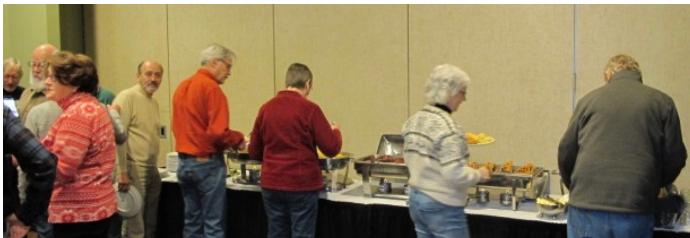
Top: Buffet at Planning Breakfast.