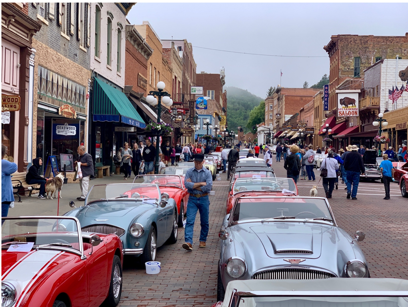
From the Conclave 2019 Downtown Car Show