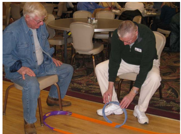
Takes Two To Tango