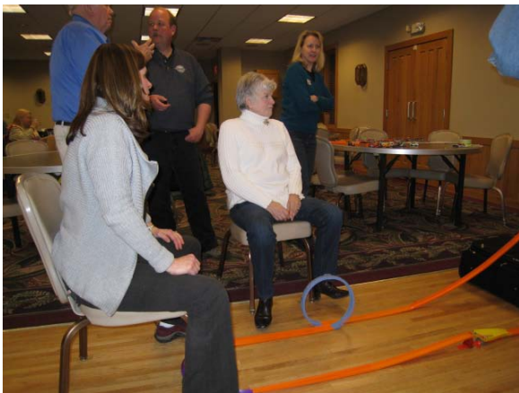
Racy Ladies !