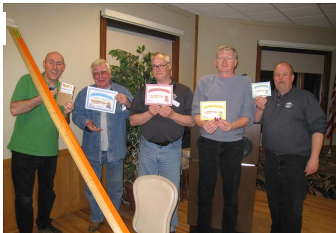
The Winnahs !