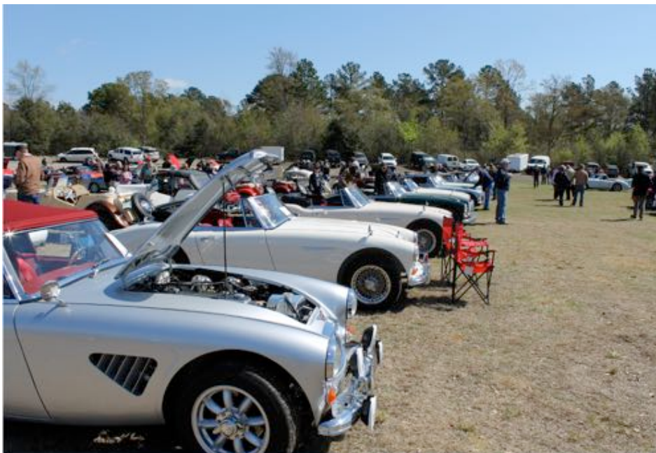
Lineup of Healeys at the Carolina British Classics IX 2015