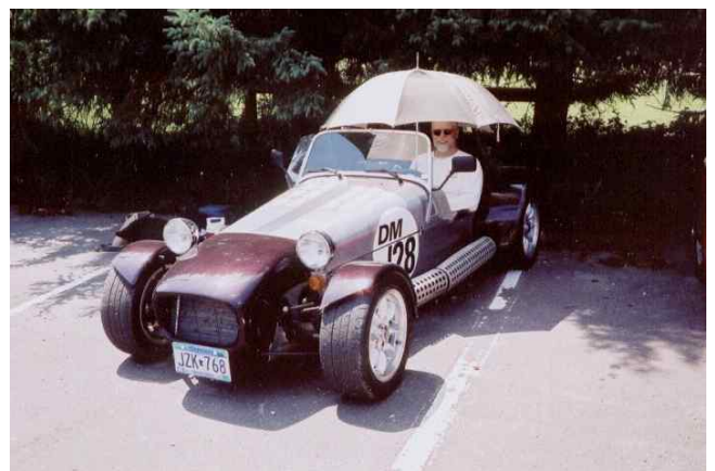
Mr. FTD !