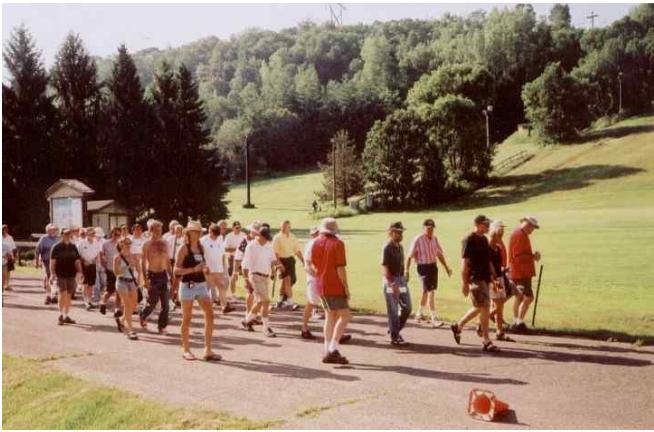
Walking the course

The day ended with no incidents, and surely people will be looking forward to next year's event. Thanks