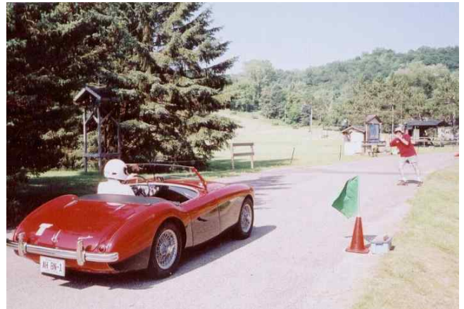
Tom starting a 100