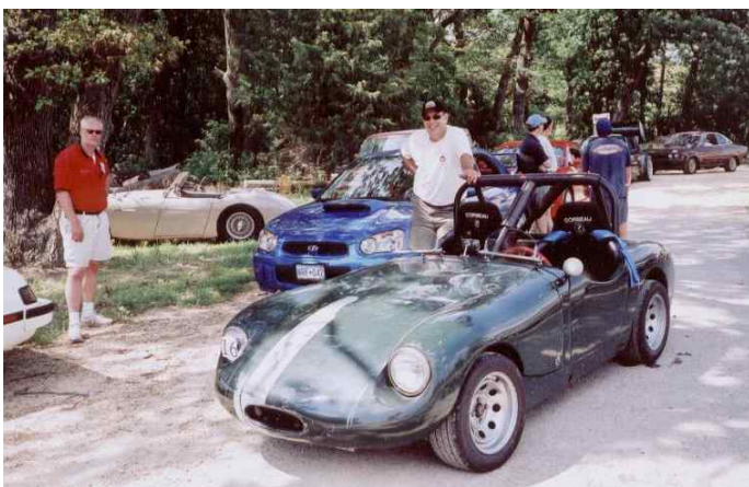
Top of the Hill