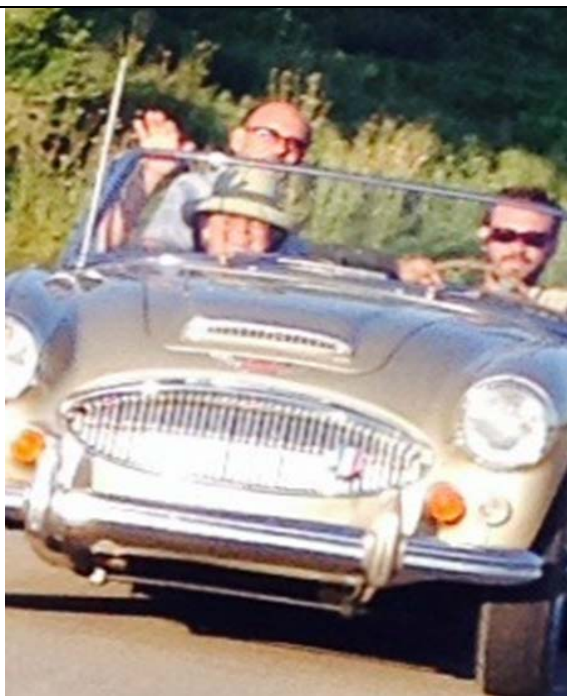
Leaving the Stine Farm.