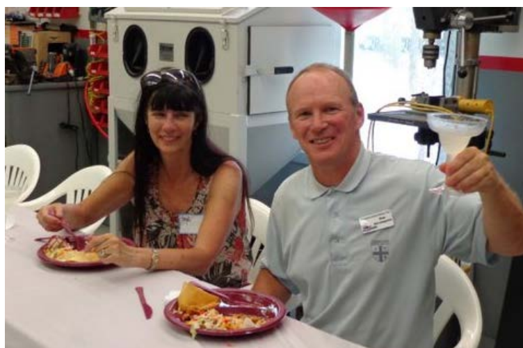
A Stromquist Margarita Toast !