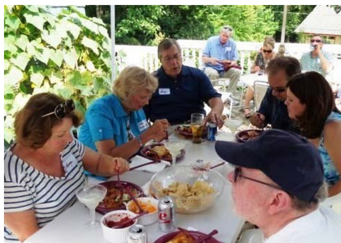
Enjoying Espanol on the Deck