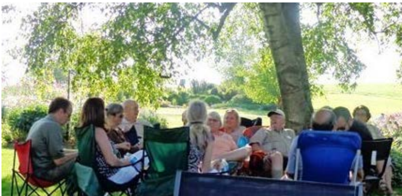
Set'n in the shade eat'n Trifle !