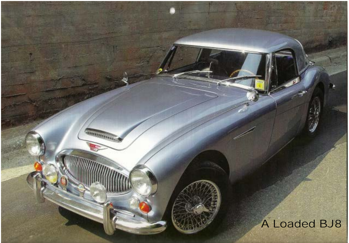
A Loaded BJ8