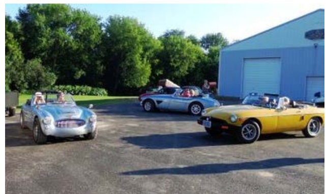
Oh, Oh ! Bumper Cars !!