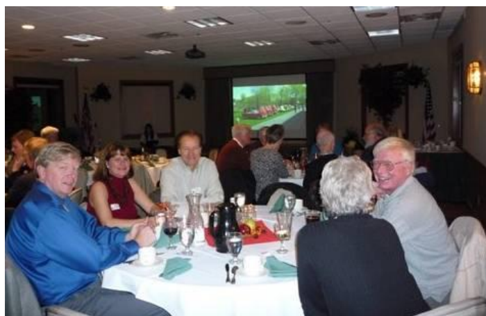
Great Food – Good Friends !