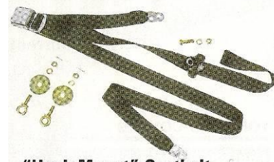
"Hook Mount" Seatbelt

Healey owner's personal Bar Stool. Seat Belt option recommended.