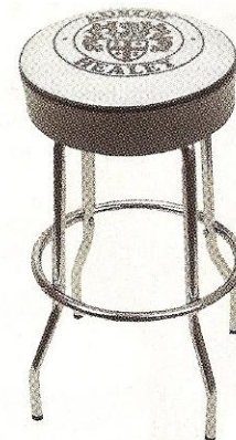
Marque Logo Bar Stool