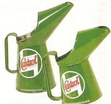
Castrol Oil Collectables

Dual purpose handy pourer for your oil or your pancake syrup !