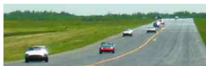
A pack of classic cars returning on the taxiway to prepare for the next run group.

Directions: The simple route is 94 East into Wisconsin, take the Baldwin Hwy 63 exit, turn left heading north on Hwy 63 which eventually becomes Hwy 46. For a more scenic drive, from the northeast corner of 694, take Hwy 36 East into downtown Stillwater, turn right and take the old drawbridge over the St. Croix into Wisconsin, following Hwy 64 East. Stay on 64 through Somerset and New Richmond, then turn left onto Hwy 46 North. The airport is on your left before you get to Amery, WI.