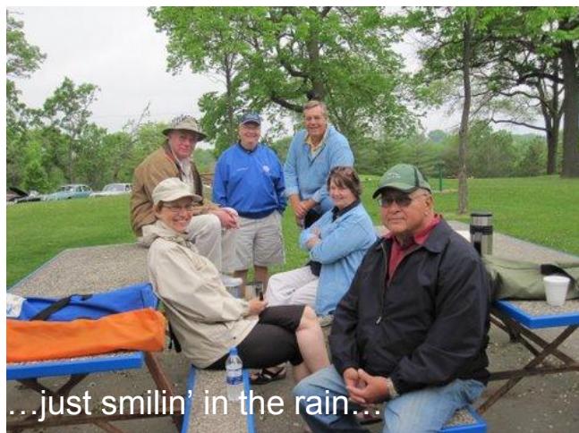
...just smilin' in the rain...

Those weathermen were right on target again, predicting a hot and sunny Saturday for this popular event. Of course it was cool and rainy. In spite of that, there was a nice turnout of people and cars at Como Park. Plenty of staff were there to help the drivers find parking in the appropriate lots. Many beautiful cars appeared, and some for the first time. The various marques were well represented, and it was a good time to renew old acquaintances. People brought picnic lunches with them, or they opted for the café in the pavilion nearby. It was a shame that the weather was not more cooperative, as people were ready to hang out around the cars and talk to friends. Maybe next year.....!