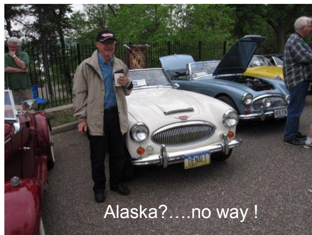
Alaska?...no way !