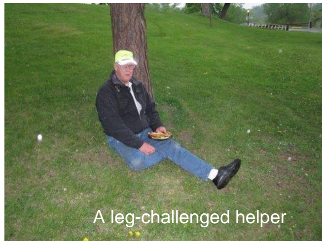
A leg-challenged helper