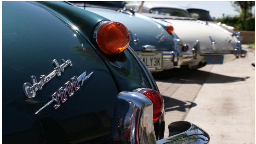
A partial line- up of the MN A-H Club's Golden Ticket Cars