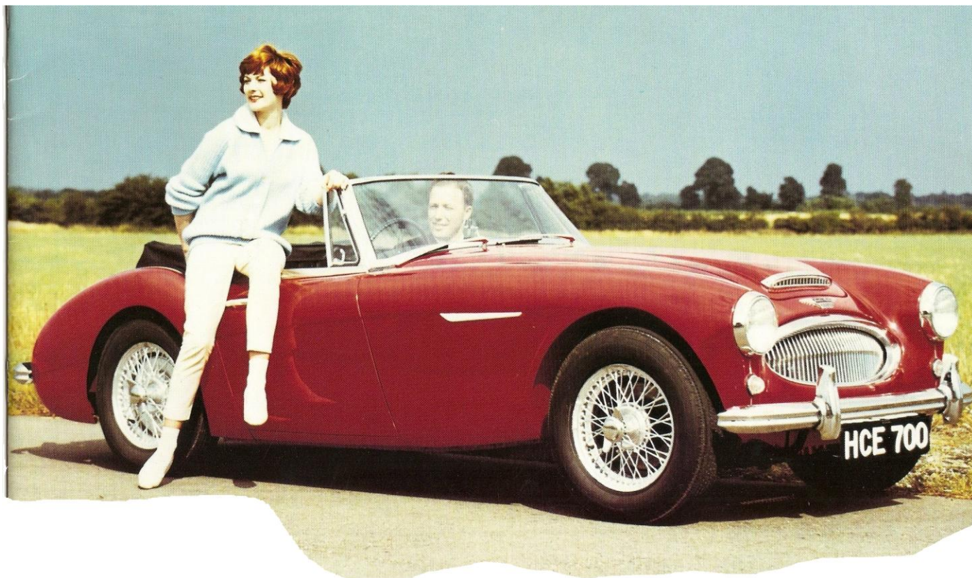
A Period Photo of the 1962 Austin Healey 3000 Mk II Sports Convertible * 50 th Anniversary *