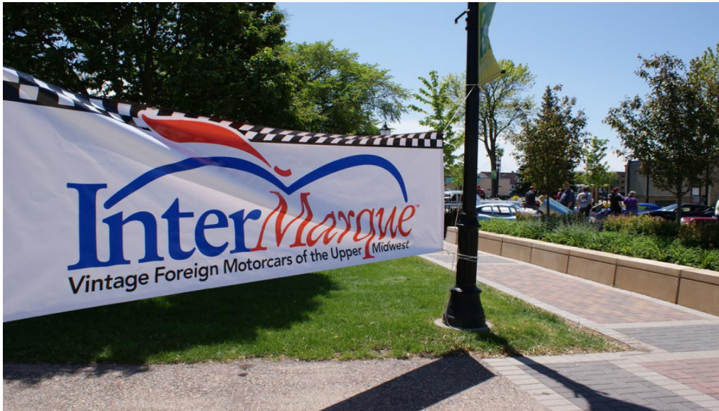
InterMarque Welcome Banner