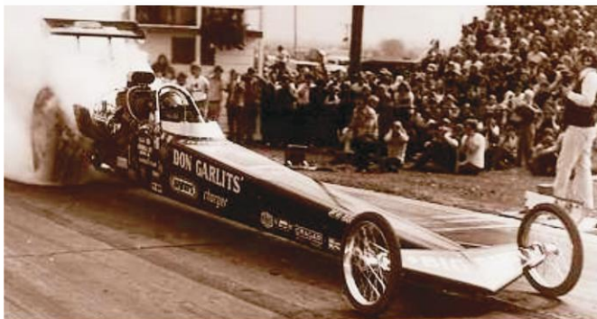
"Big Daddy" Don Garlits

Wednesday, March 3, 2010, beginning at 7:00pm