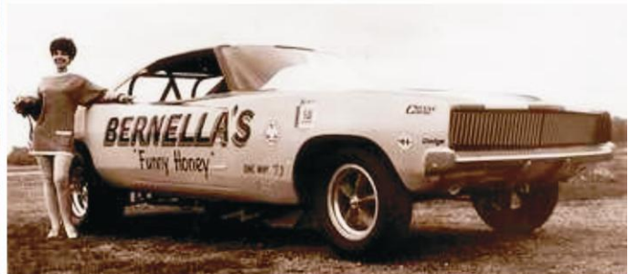
Della "Funny Honey" Woods

Any vehicle that fits on a standard orange Hot Wheels track is allowed, as long as its sole source of power is gravity. Other than that, it's unlimited! You can run bone stock or modified (fishing weights in the passenger compartment, pennies scotch taped to the roof, etc.) You are free to modify your car between runs, and you can run multiple cars. If you arrive empty handed don't worry, we will have some loaner cars for you, as long as you are willing to sign the collision damage waiver. Cars will be run one-at-a-time by specially trained race officials, using a state-of-the-art electronic timing system (a stopwatch and a thumb).