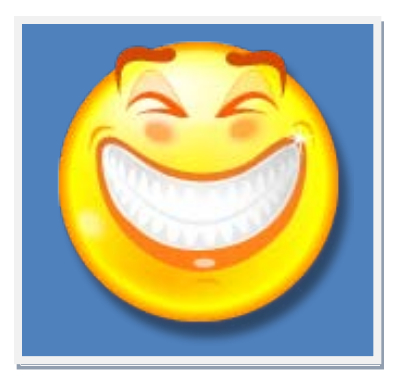
(Continued on page 4)

The important part of this story is that abutment screws need to be torqued. We have a small wrench solely for this purpose. My boss had a habit of torquing five to six times quickly and consecutively. With a titanium abutment this is not a big deal, but the fateful day came when a gentleman presented a "more difficult" case. We were about to place three porcelain crowns on three zirconium abutments to finish his treatment and give him a beautiful smile (they were towards the front). The final act before cementing the crowns was to torque the abutment screws which previously had been only hand tightened. Using the wrench with great gusto, my boss went at it while I squirmed in my chair. Before I could finish mixing the cement, "ping, ping", and two of the three abutments had shattered. (I could go into the differences in abutments regarding compressive and intrinsic strengths, but choose to spare you. Don't ever doubt a zirconium abutment.) Because of the difficulty of the case and the excessive torque forces, these abutments broke. Needless to say, my boss was not a happy camper. The patient was not thrilled either. Now we had to place and prep new abutments, re-impression, remake new temporary crowns, and wait another four weeks for the finished porcelain crowns - all at an additional cost to the dentist. The good news was that we stock abutments and had the type needed on hand.