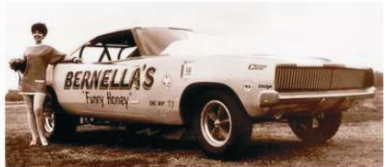
Della "Funny Honey" Woods

Any vehicle that fits on a standard orange Hot Wheels track is allowed, as long as its sole source of power is gravity. Other than that, it's unlimited! You can run bone stock or modified (fishing weights in the passenger compartment, pennies scotch taped to the roof, etc.) You are free to modify your car between runs, and you can run multiple cars. If you arrive empty handed don't worry, we will have some loaner cars for you, as long as you are willing to sign the collision damage waiver. Cars will be run one-at-a-time by specially trained race officials, using a state-of-the-art electronic timing system (a stopwatch and a thumb).