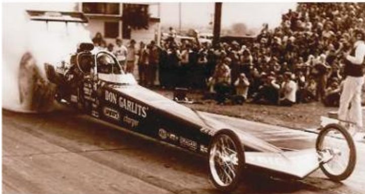
"Big Daddy" Don Garlits

Wednesday, March 7, 2012, beginning at 7:00pm