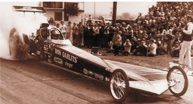
"Big Daddy" Don Garlits

Wednesday, March 6, 2013, beginning at 7:00pm