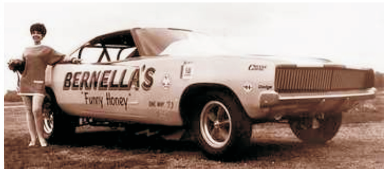
Della "Funny Honey" Woods

Any vehicle that fits on a standard orange Hot Wheels track is allowed, as long as its sole source of power is gravity. Other than that, it's unlimited! You can run bone stock or modified (fishing weights in the passenger compartment, pennies scotch taped to the roof, etc.) You are free to modify your car between runs, and you can run multiple cars. If you arrive empty handed don't worry, we will have some loaner cars for you, as long as you are willing to sign the collision damage waiver. Cars will be run one-at-a-time by specially trained race officials, using a state-of-the-art electronic timing system (a stopwatch and a thumb).