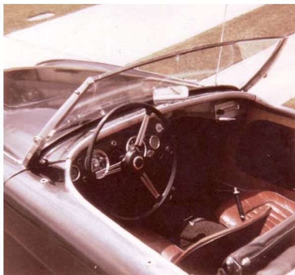
Note after market radio in dash !