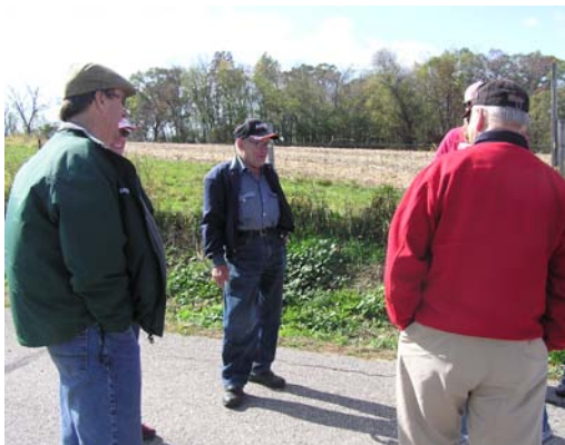
The Norwegian Bachelor Farmer...