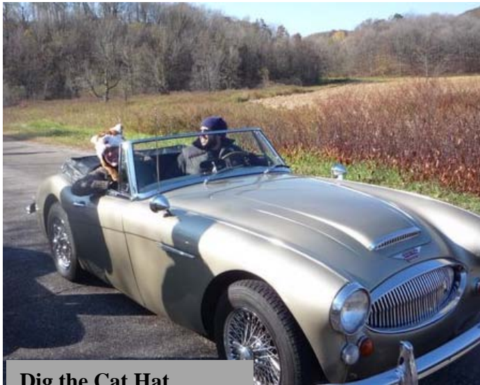
Dig the Cat Hat....