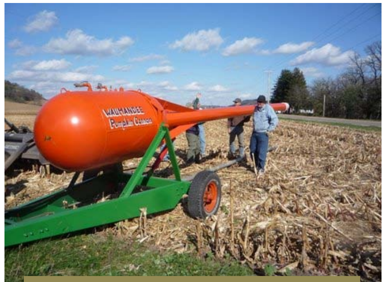
The Pumpkin Cannon !!