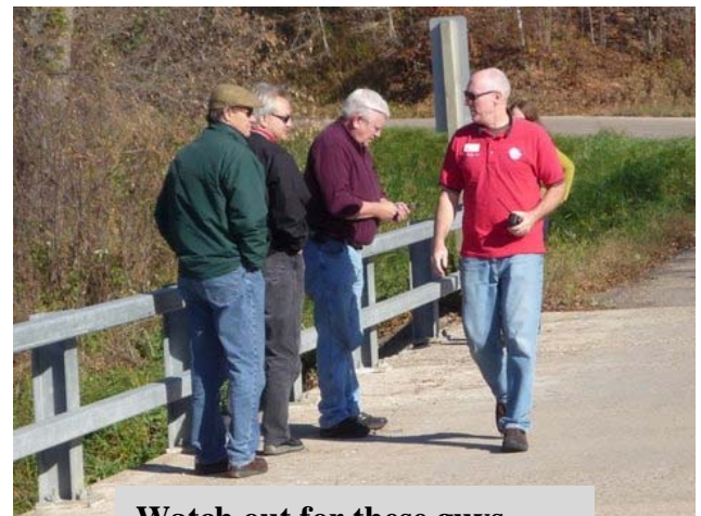
Watch out for these guys...