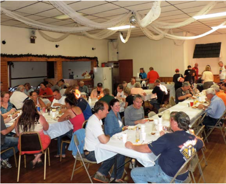
Chow time at Waumandee