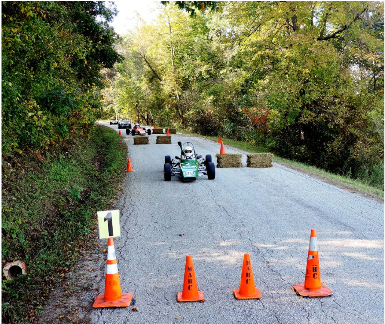
The Waumandee Hillclimb!