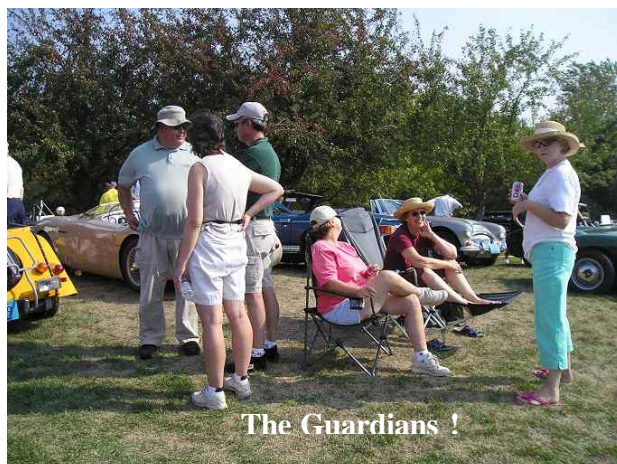
The Guardians !