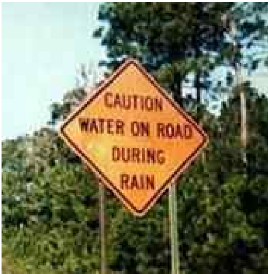
Thought provoking Road Sign !