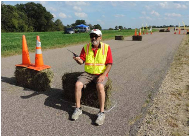
Ready, Set, GOOOO!