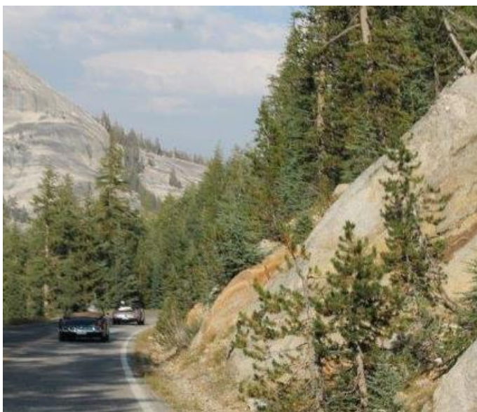
....and there were mountains...!