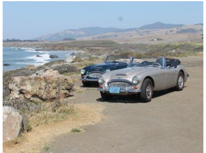
Lauser & Wetzel cars at a scenic spot