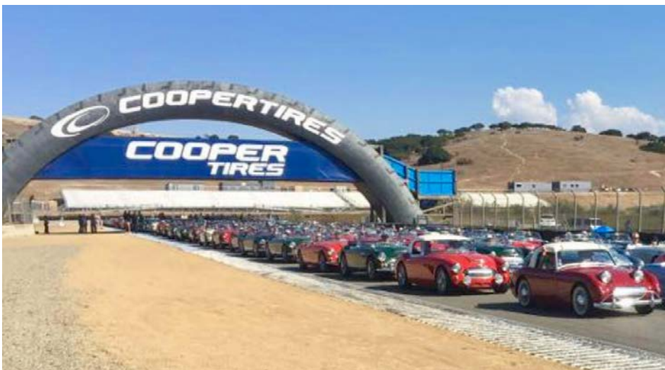
Looks like a RUMBLE !