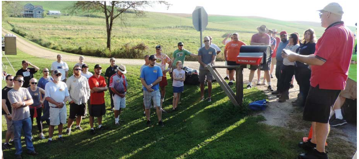
The Drivers' Meeting