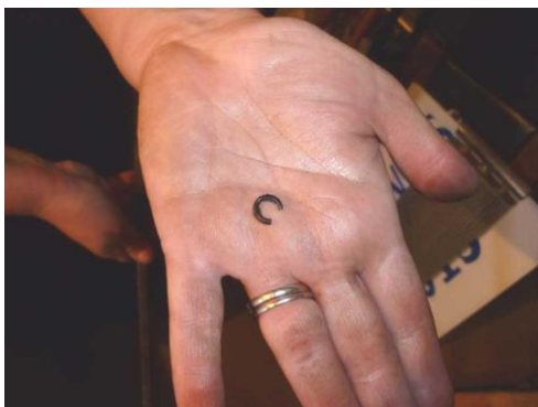
Most were crumbs!