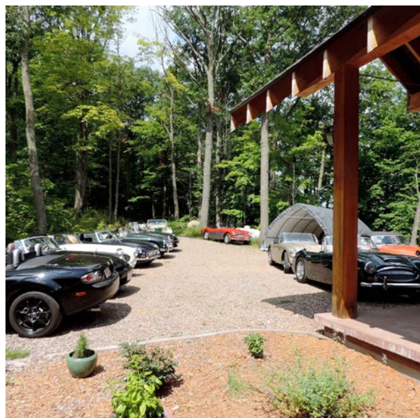
Cars galore !