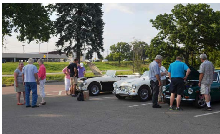
Checkin' out those engines !