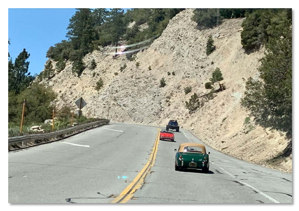
The Rim of the World drive at Conclave 2021

As we all know, Conclave at Deadwood was