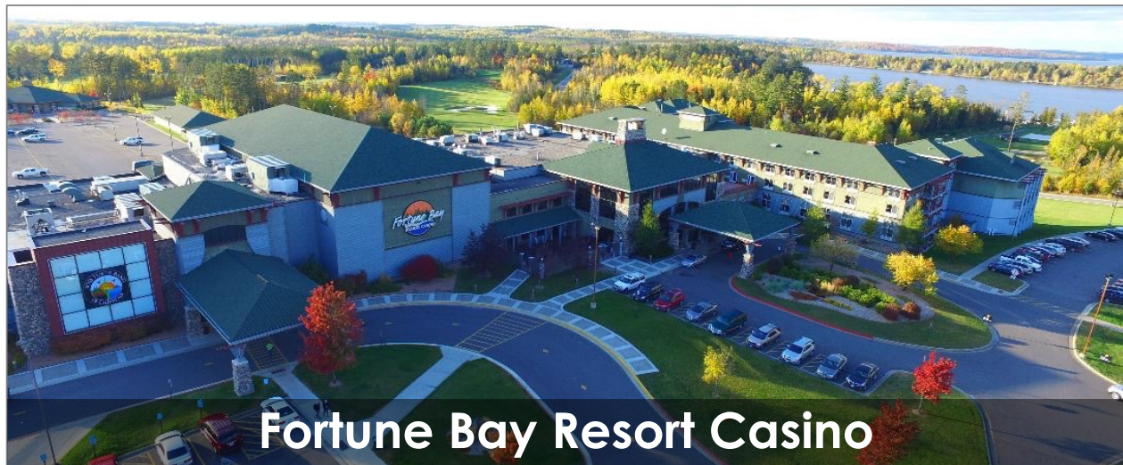
Fortune Bay Resort Casino

NOTE: Some Events and attractions require a reservation. Golf at Fortune Bay: call to schedule a tee time -1-800-992-4680. Reserve a boat or pontoon at the Marina to ride or go fishing Call 218-753-7875. Reserve a spot to ride along on the Lake Vermillion Boat mail delivery , spots are limited AronsonBoatWorks.com. Reserve a spot for the Sudan Mine Tour - Tour is about 2 hours long and reservations need to be made.- mndr.gov/VermillionSoudan. Check on tour times - International Wolf Center - 218-365-4695 North American Bear Center 218-365-7879