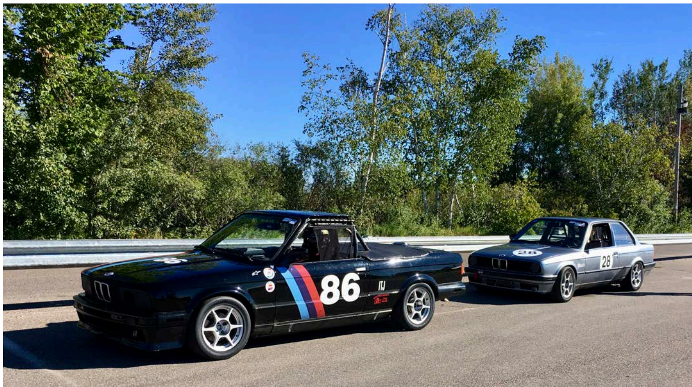
Bottom: The Black MW (Jessica) takes on the Blue MW (Jeff).