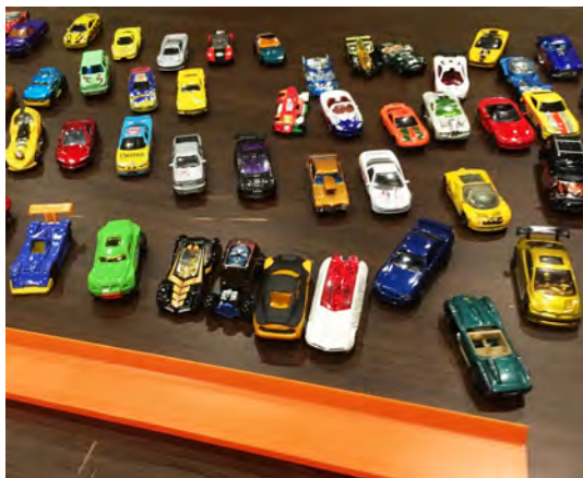
The parking lot....!