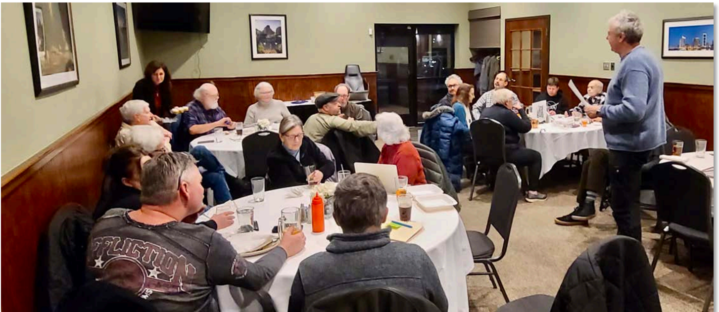
President's Informal Event (PIE) meeting in January 2025.