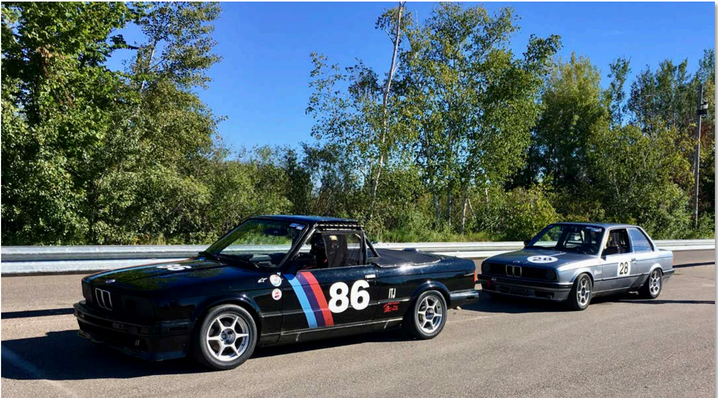
Bottom: The Black MW (Jessica) takes on the Blue MW (Jeff).