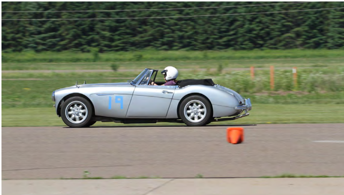
Eileen Wetzel on the course.