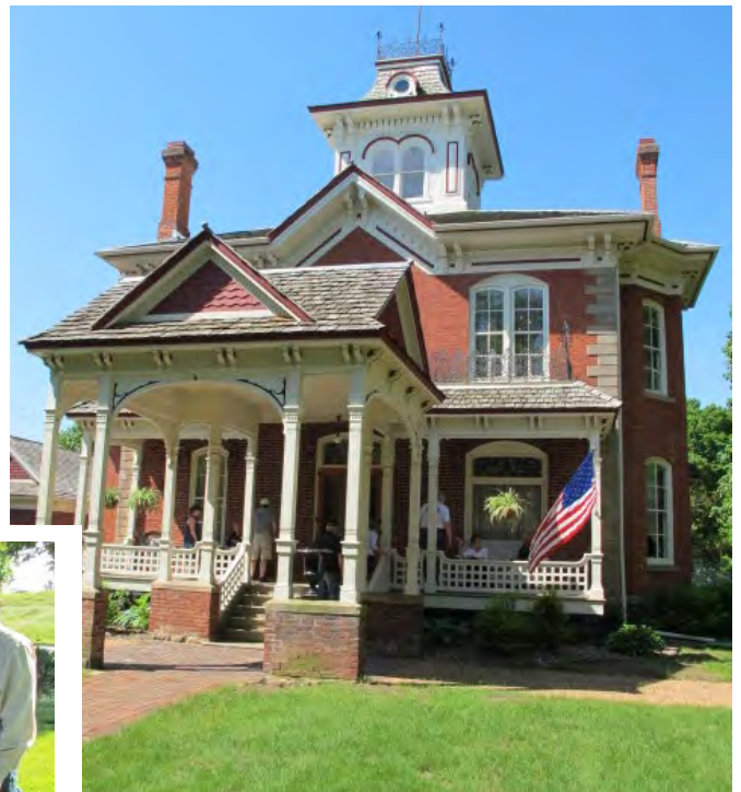
The Cook-Rutledge Mansion built by a lumber baron in the mid 1800s.