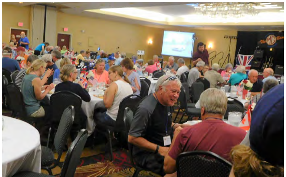
Lots of refreshments, food .... and people having a good time !!