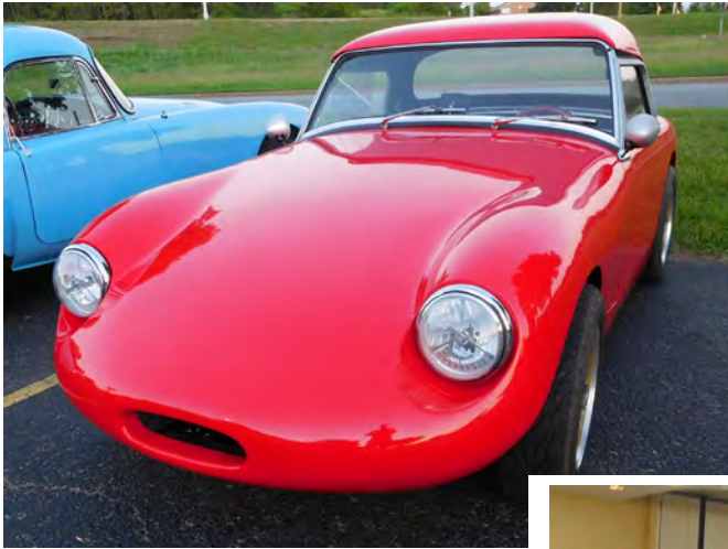
A nice 1959 A-H Sprite with a Sprinzel type Bonnett !