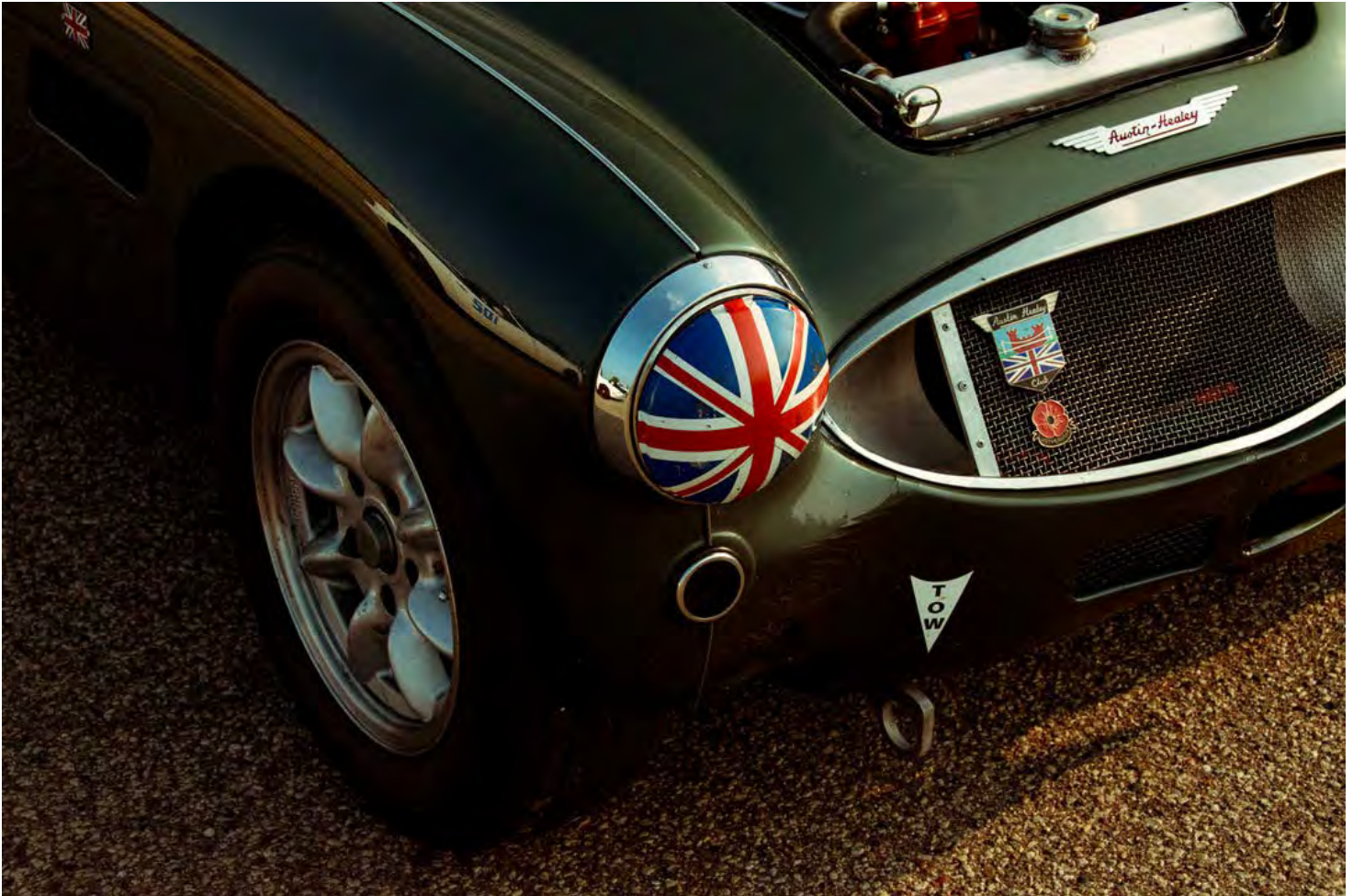
Photo from MAHC Track Day