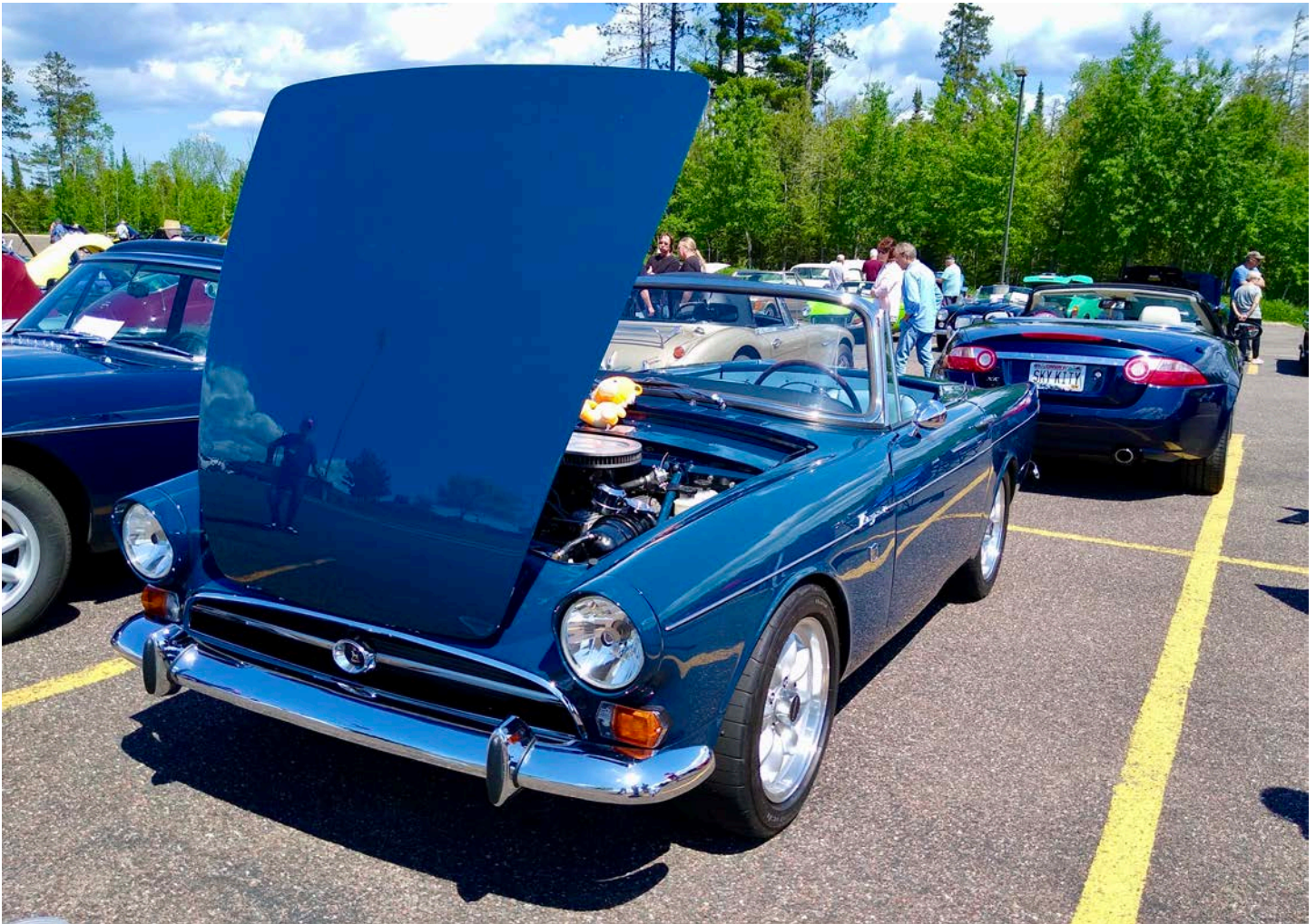
At Rendezvous 2022, this beautifully restored Sunbeam Tiger won the Popularity Car Show, helping to raise over $850 for the local Boys' and Girls' Clubs.