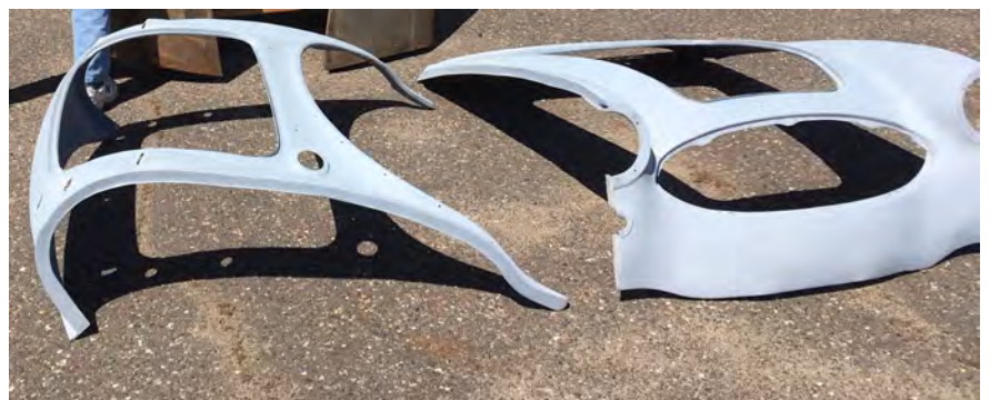
Healey update: Some of the parts that will one day become a car.