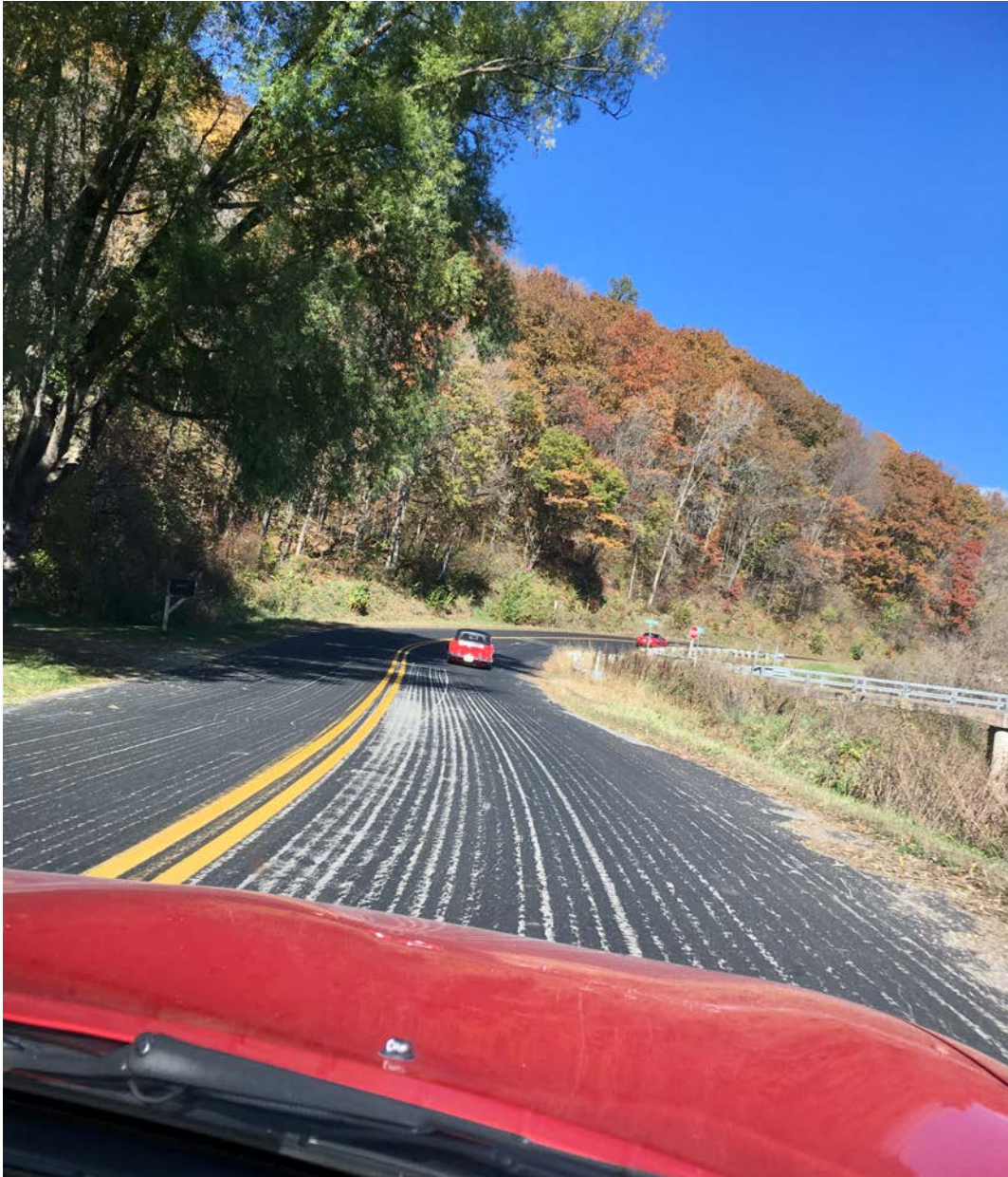
From the 2021 Fall Color tour.