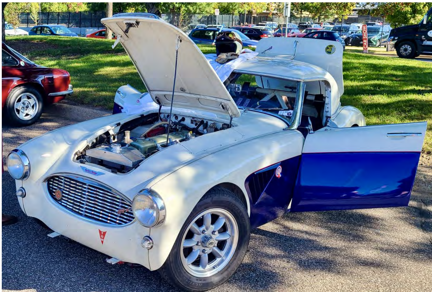
Steve Rixen's soon-to-be-ex racecar at the InterMarque Car Show to benefit the Lift Garage back in September.