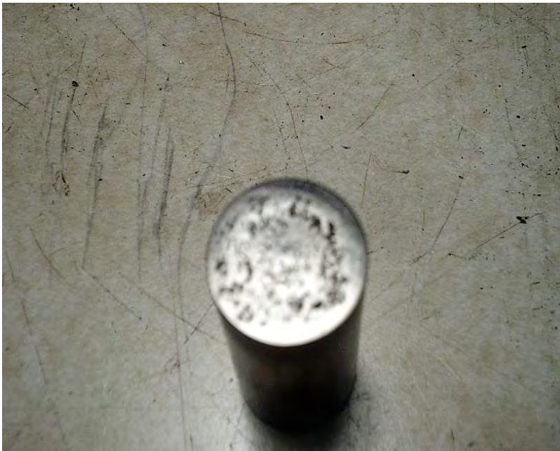
This is the acid eroded surface of a tappet showing the disintegration of the face where it rides on the cam. This is what you avoid by changing the oil in the fall.

After the oil is filled, install the mostly oil-filled spin-on filter. Disconnect the low voltage wire at the distributor (white wire with the black stripe for most Lucas wiring systems) from the coil to distributor (stock ignition system), so the engine will not fire. Run the starter until you see oil pressure register on the gauge. Once the engine shows oil pressure, reconnect the wire, start the engine, and verify there are no leaks at the filter or drain plug.